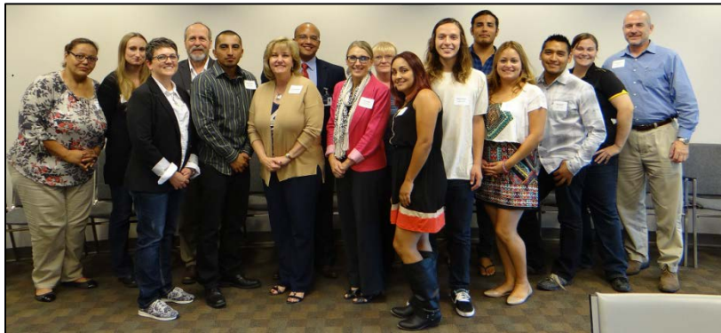
Pictured above are the attendees at the October 22 nd luncheon.

Taft College hired a total of 33 staff from fall 2014 to fall 2015. Two New Employee Luncheons were held to accommodate them all. Each luncheon included a brief slide show featuring each new employee and a review of important documents that provide an overview of the College and its place in the state and local community.