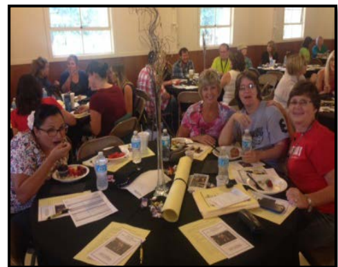
Staff participating in a Mission, Vision & Values Exercise at the 2014 Welcome

Last year, the College completed an updated Educational Master Plan (available on the campus website under About Us ). The plan included broad recommendations for Taft College for the next ten years. This year, after reviewing and updating the College's vision, mission, and values, we will be developing a three-year Strategic Action Plan, which will identify those recommendations of the Educational Master Plan we want to tackle first.