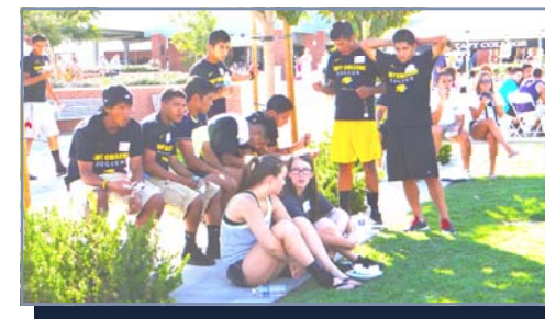
TC Day 2012